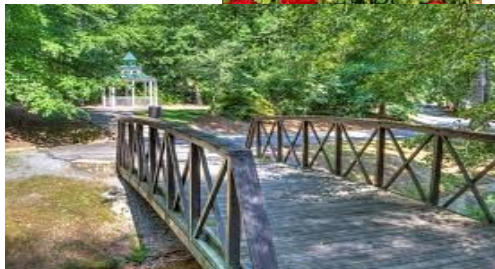
Landscaping plan pending, this is a depiction of what we could develop on this site.