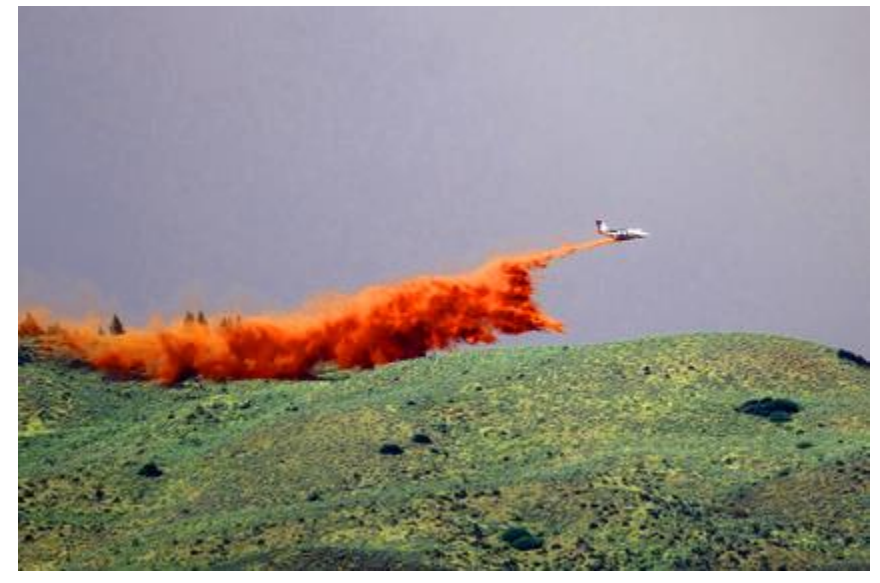
Agent Orange used in Vietnam-era

The Congressional Budget Office projected that direct benefit payments for disability compensation would increase by $208 billion over a decade