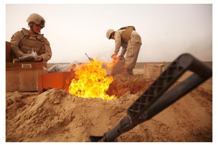
Marines dispose of trash in a burn pit in Afahanistan.

will take up a bipartisan bill that will dramatically broaden America's commitment to take care of sick veterans.