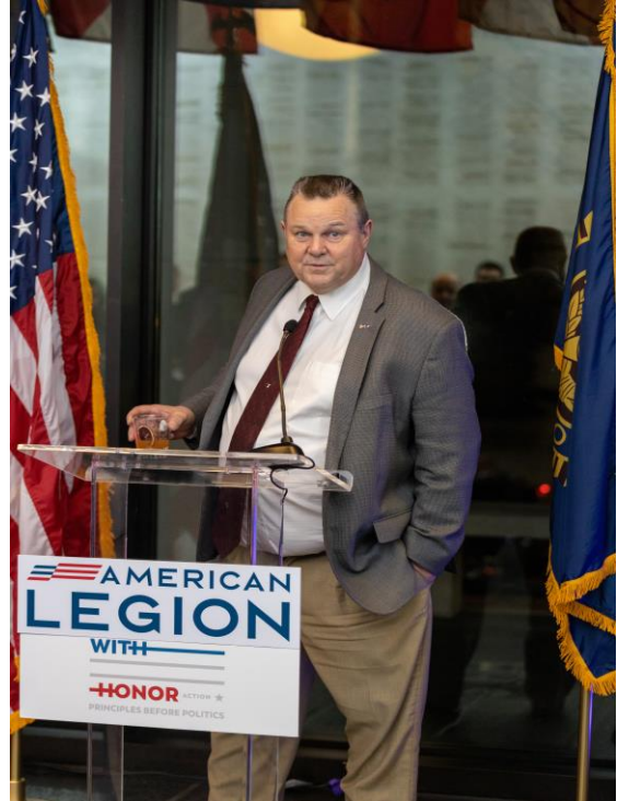
Chairman Tester (D-MT) spoke at the event and expressed his support for The American Legion and veteran community.

Other attendees included fellow VSO members, HVAC and SVAC professional staff, and many other members of the veteran community. Guests enjoyed veteran-owned brewery tasting, political themed cocktails, and food.